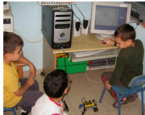
Figure 1: “Robogan” – the robotics behavior-construction interface and robotics working area in the kindergarten